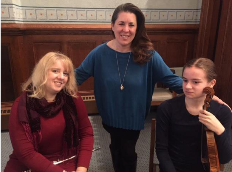
Musicians and Volunteers Enliven the Liturgy