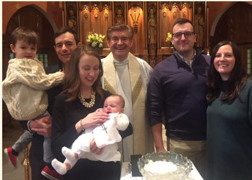
First Wedding and First Baptism of 2019 at Our Lady, Star of the Sea