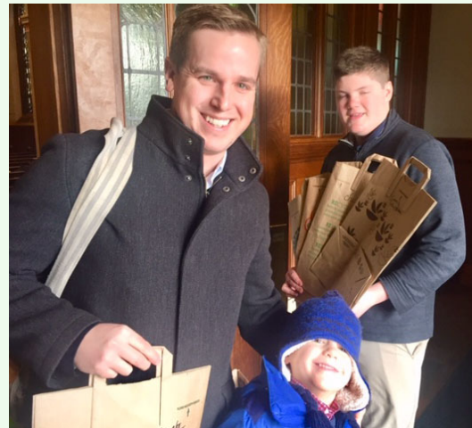
Preparing for our February Food Drive